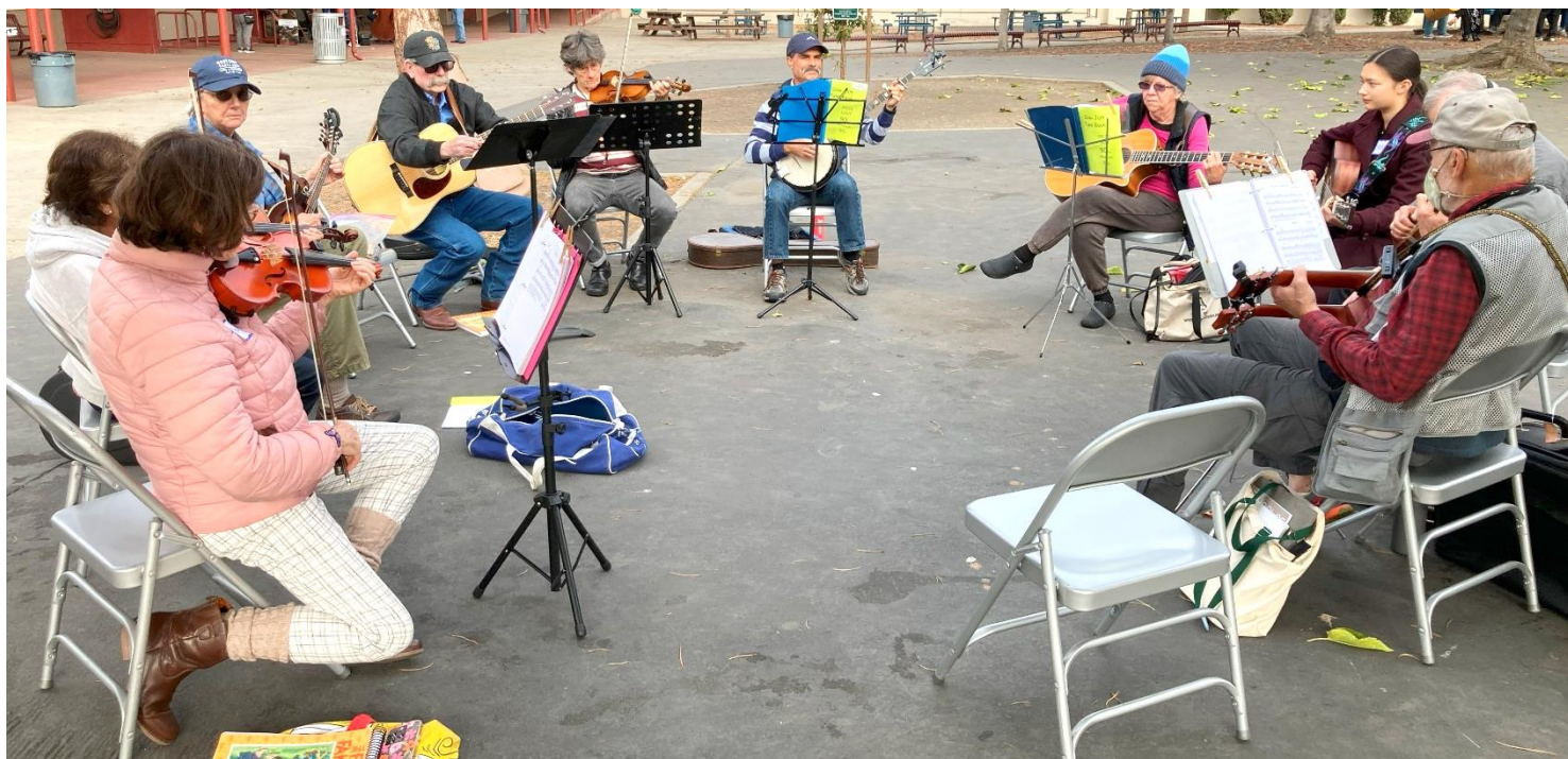
The Slow Jam at the December Jam