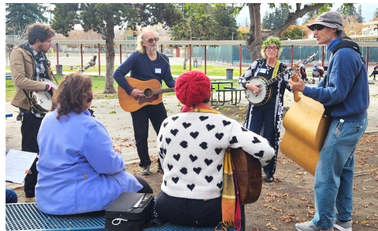
A bluegrass circle at the December jam